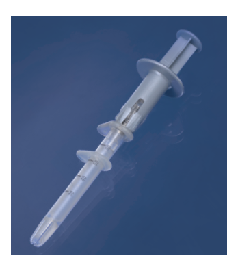
Device Use Measures length of female urethra in order to determine the correct inFlow device size for patient