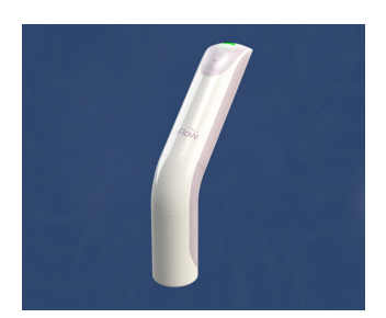
Figure 2: Activator magnetic remote control