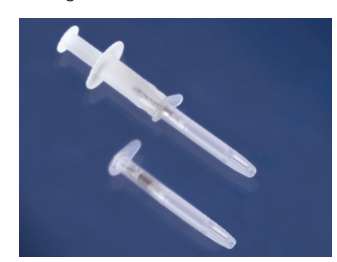
Figure 1: The inFlow device as supplied with disposable introducer (top) and without (bottom)